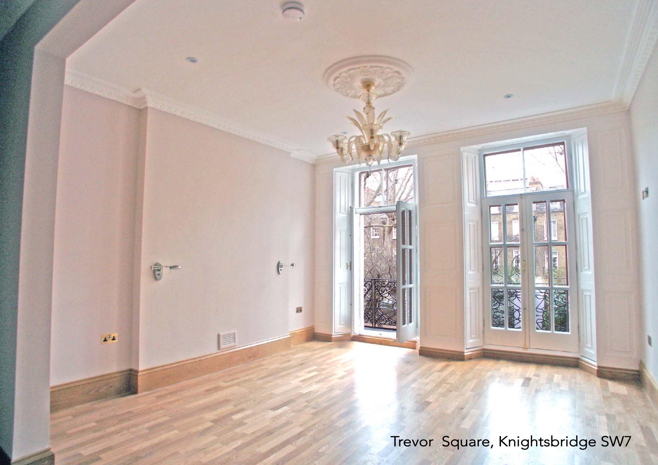
Trevor Square, Knightsbridge SW7